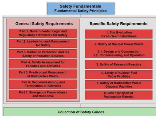
FIG. 1. The long-term structure for the IAEA Safety Standards Series.