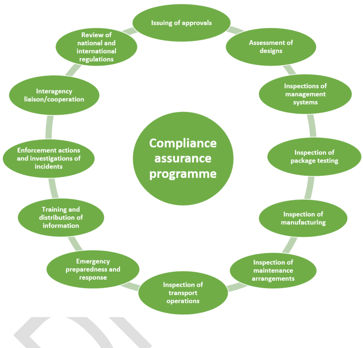
FIG. 1. Compliance Assurance circle.

4.3. These activities are not meant to be implemented in any particular order, and the extent of a national compliance assurance programme may not necessarily cover all of these activities. It depends on the quantities and types of packages being transported, and also the size and complexity of the transport industry for which the competent authority has responsibility, as well as its own resources.