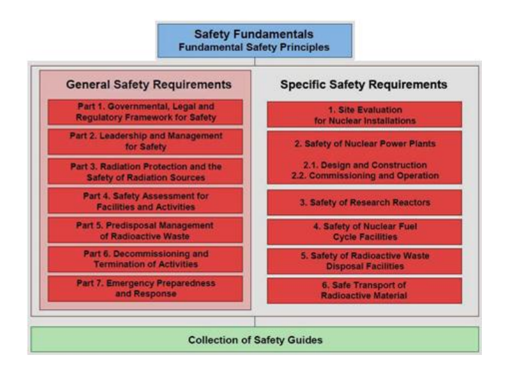
FIG. 1. The long_-term structure for the IAEA Safety Standards Series.